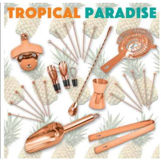
Available in cool gunmetal, art deco inspired gold, and bright, trendy rose gold.

"These items really show the test of time – made of durable stainless steel, plated with on-trend colors such as classic gold, black gunmetal, and fresh rose-gold; you can have the look of luxury without breaking the bank," said lead graphic designer Androo Lum. "Our customers are really looking for items that can provide them with the style they see in housewares magazines and on Pinterest, but at a price that is affordable to them."